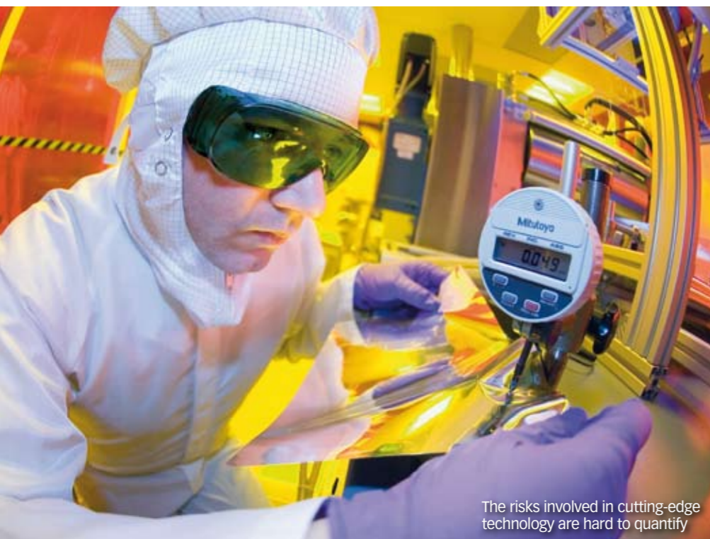
The risks involved in cutting-edge technology are hard to quantify