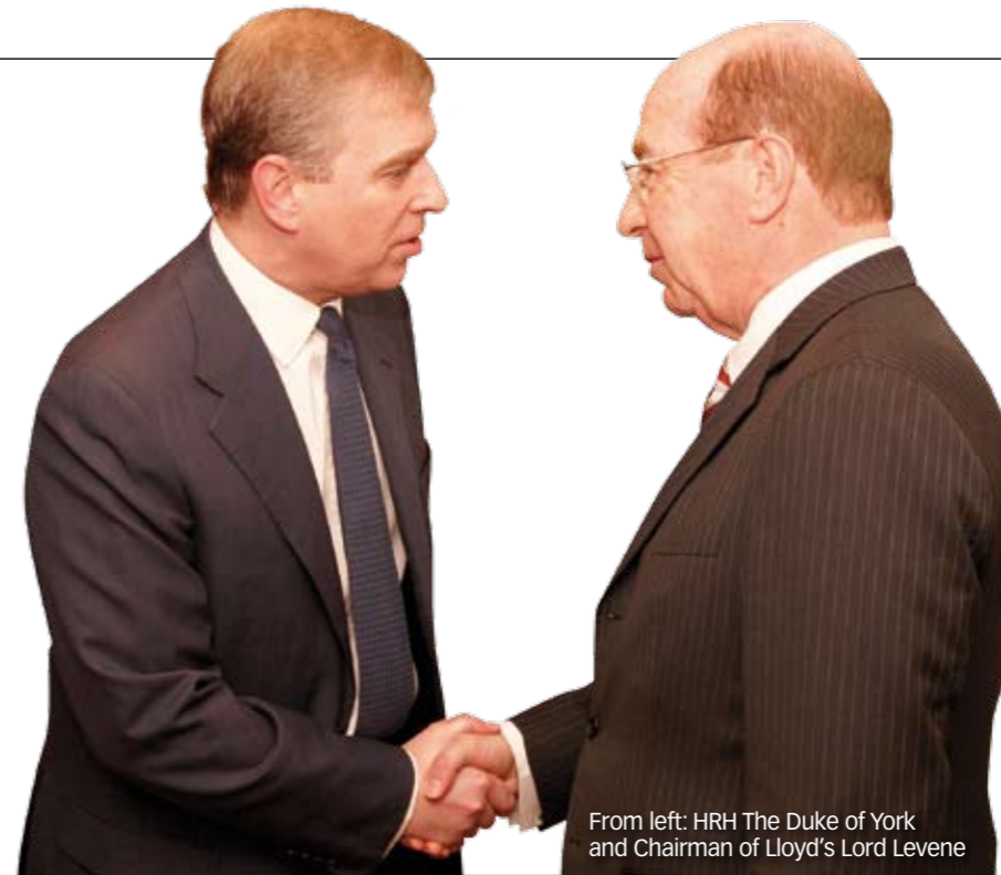
From left: HRH The Duke of York and Chairman of Lloyd's Lord Levene

Care has been taken to ensure accuracy of information but neither Lloyd's nor the publishers can accept responsibility for omissions or errors. Lloyd's is regulated by the Financial Services Authority. © Lloyd's 2009