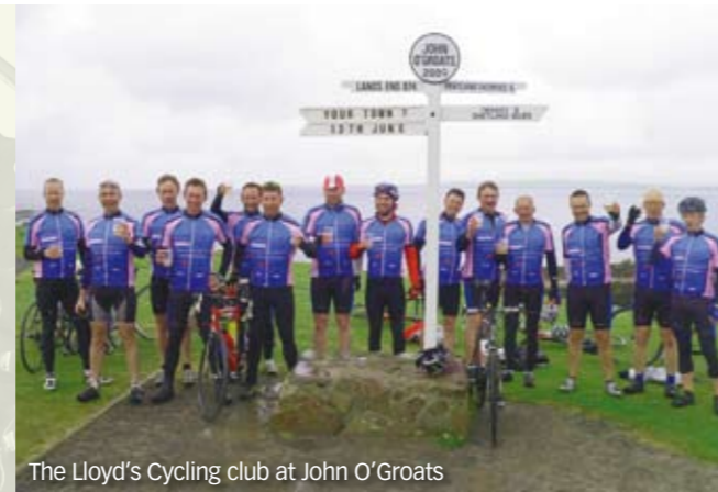
The Lloyd's Cycling club at John O'Groats

The Lloyd's Cycling Club is a group of enthusiastic riders,