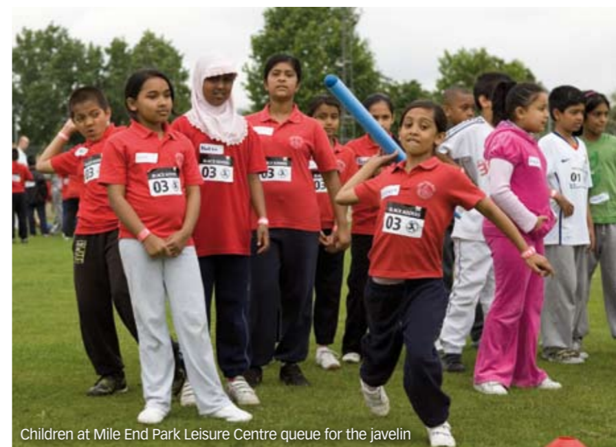
Children at Mile End Park Leisure Centre queue for the javelin

“All pupils brought away from the event a strong sense of teamwork as well as respect for their opponents”