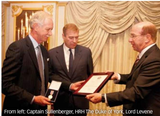
From left: Captain Sullenberger, HRH The Duke of York, Lord Levene

THE LLOYD'S GOLD MEDAL FOR Saving Life has been awarded for the second time in 173 years. This distinguished badge of honour, which recognises acts of courage in the saving of lives, was presented to airline