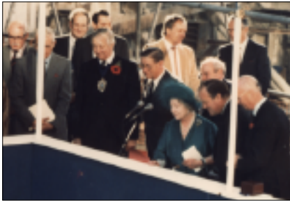
The Queen Mother opens One Lime Street