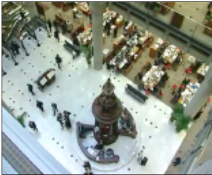
The Lloyd's Underwriting Room today