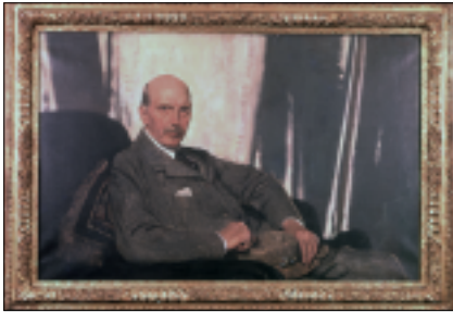
Cuthbert Heath – reinsurance pioneer