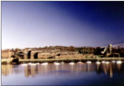
Lloyd's Chatham building

1997 Conclusion of 'Reconstruction and Renewal' Lloyd's Settlement proposals are accepted by 95 per cent of Members.