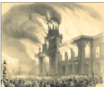
Fire rages at the Royal Exchange