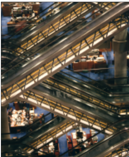
Lloyd's today, designed by renowned architect Lord Rogers