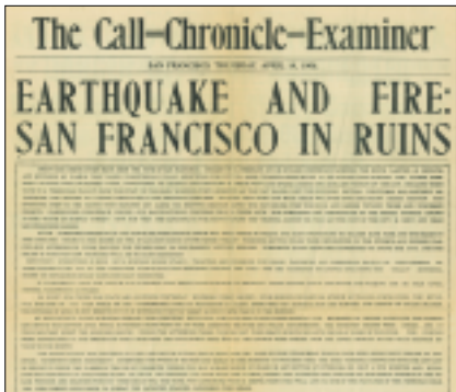
San Francisco disaster is front page news