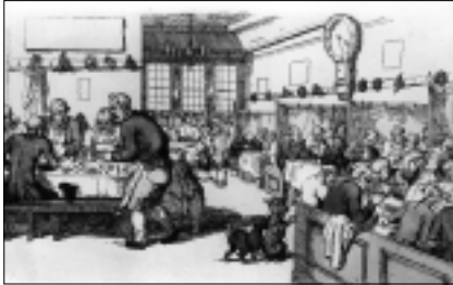
Business deals in the informal surroundings of Edward Lloyd's Coffee House

1688 First known reference to Edward Lloyd's coffee house in Tower Street (London Gazette 18-21 February 1688).