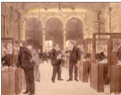
Inside the Lloyd's Underwriting Room